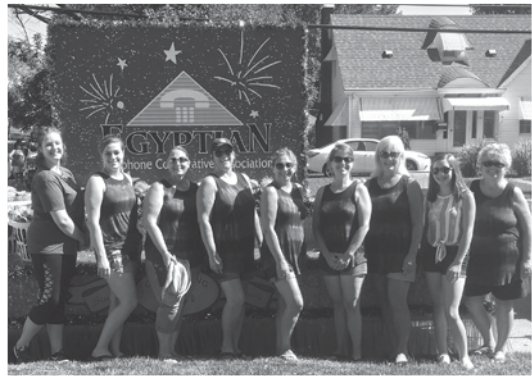
Egyptian employees enjoyed participating in area parades this year.

Egyptian Telephone Cooperative Assn. • August 2018